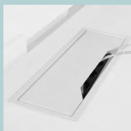
Metal grommet: 317x119 mm, H=27 mm (for desks with cut- out)