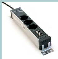
Power socket blocks