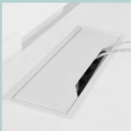
Metal grommet: 317x119 mm, H=27 mm