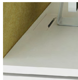
Desktops with a cut-out for grommet and wire management