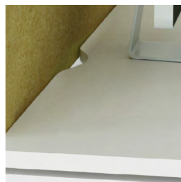
Desktops with a scallop for wire management